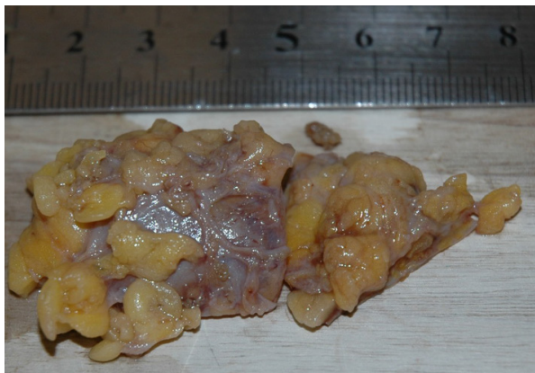
Figure 2. Macroscopic view of cystic breast tumor (about 60x35 mm in size).

Modified radical mastectomy (MRM) was planned to be performed on the patient, who was pre-diagnosed with IPC. During operation this specimen excised was as about 60x35 mm in sizes. It also seemed like a hard and cystic mass with an outer surface surrounded by fat (Figure 2).