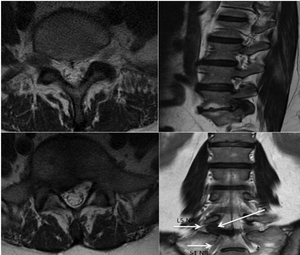
Figure 1. Preoperative axial, sagittal, and coronal MRI scans of a case operated on using the combined approach due to foraminal and far lateral disc herniation (arrow). Herniated discs were displayed only on different sequences. This patient had biradicular pain and the neural roots (L5 and S1 nerve roots) were decompressed with combined approach. MRI = magnetic resonance imaging, NR=nerve root.

lateral) and unilateral stabilization for patients with MFDH on radicular pain in the early postoperative period.