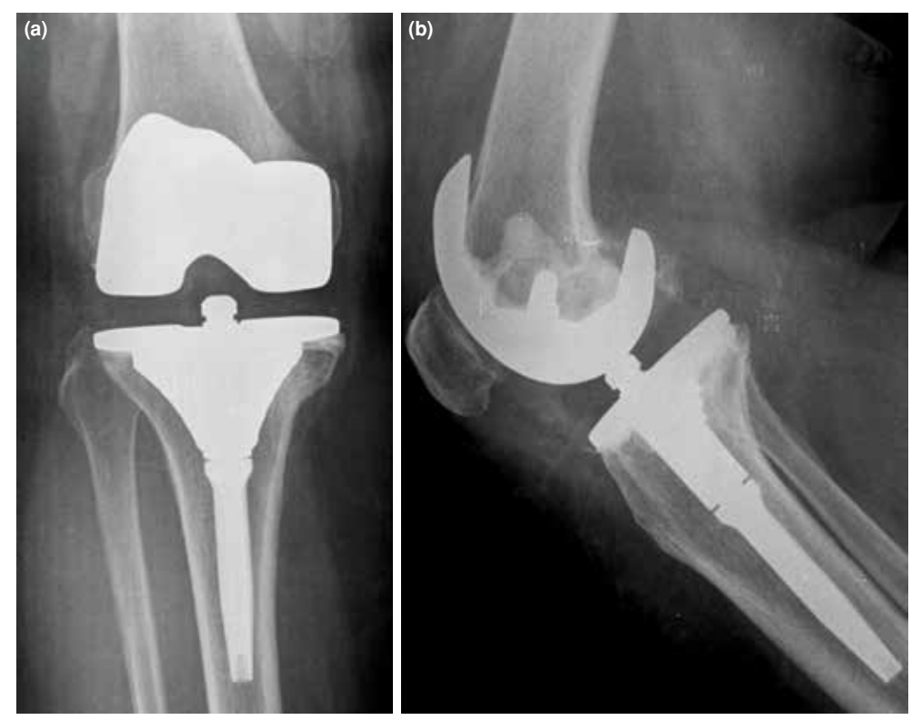
Figure 4. (a) Anteroposterior and (b) lateral graphies of revision of unicompartmental knee arthroplasty with primary total knee replacement.

study suggested the use of this implant if the results of long-term and comparative studies were to be successful.<sup>[6]</sup> Unicompartmental knee arthroplasty and TKA survival rates were compared in another study based on England and Wales registry data in 2014, which included 25,334 UKA and 75,996 TKA cases.<sup>[7]</sup> As a result of the study, TKA survival was found to be 94.6% while UKA survival was 87% on an average of eight-year follow-up. They further reported that the revision rates were higher in UKA cases and the most common reason of revision was aseptic loosening.<sup>[7]</sup> In a 2008 study based on Finnish registry