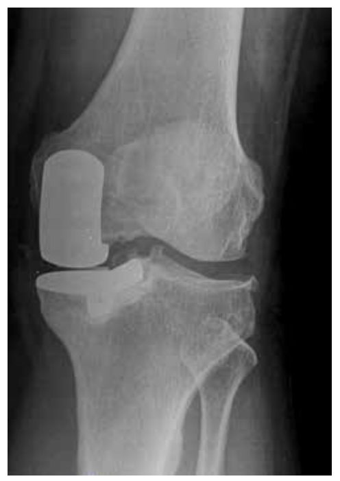
Figure 3. Anteroposterior graphy of knee lateral compartment arthrosis.

Findings of this study indicate that the rate of complications of mobile phase Oxford insertion UKA surgery was high and long-term survival was low. The rate of early revision related to aseptic causes was