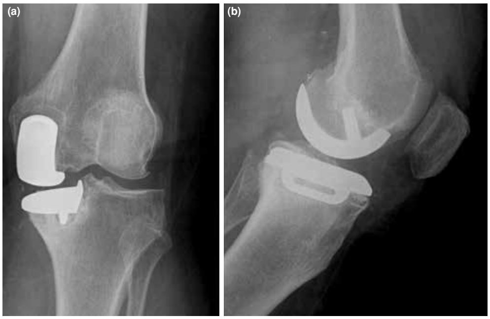
Figure 2. (a) Anteroposterior and (b) lateral graphies of tibial loosening.

the insert change were not included in the revision group. In these eight patients, anatomic insert was used for the insert change. Totally, 21 patients (15.6%) underwent revision knee surgeries. Among them, revision surgeries were performed due to insert redislocation in nine patients, tibial loosening in seven patients (Figure 2a, b), lateral compartment arthrosis in two patients (Figure 3), patellofemoral arthrosis in one patient, medial joint pain in one patient and medial collateral ligament failure in one patient (Table II). Revision knee arthroplasty with primary total knee replacement (TKR) was performed in 19 patients and revision knee arthroplasty in two patients. Tibial extension stem was used in three of these 19 TKR patients (Figure 4a, b). No infection was observed in any of the patients. The mean time to the revision was 72 months (range, 27-88 months). Unicompartmental knee arthroplasty survival rate by Kaplan-Meier index was 85.5% in 126 months (Figure 5).